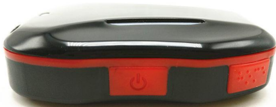
power button SOS2