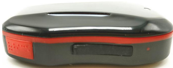
SOS1 sim card slot